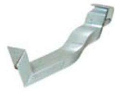
DIE CAST ANGLES Internal & External 45° and 90°