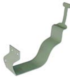
EXTERNAL BRACKET Fixing to Fascia