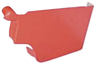
STOP END Galvanised or Colorbond®