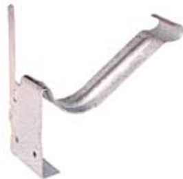
INTERNAL BRACKET Concealed fixing to Fascia