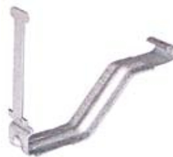
GUTTER STIFFENER For fixing to Metal Fascia