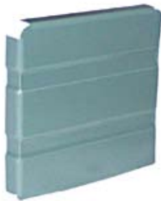
STOP END Zincalume or Colorbond® finish