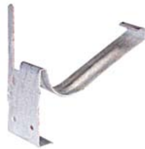
INTERNAL BRACKET Concealed fixing to Fascia