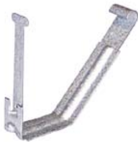
GUTTER STIFFENER Concealed fixing to Fascia